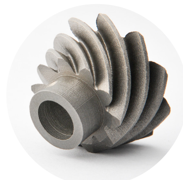
316L Printed Part

Note: Preferred part size <50 x 50 x 25mm. Parts up to 150 x 150 x 150mm are subject to engineering review.